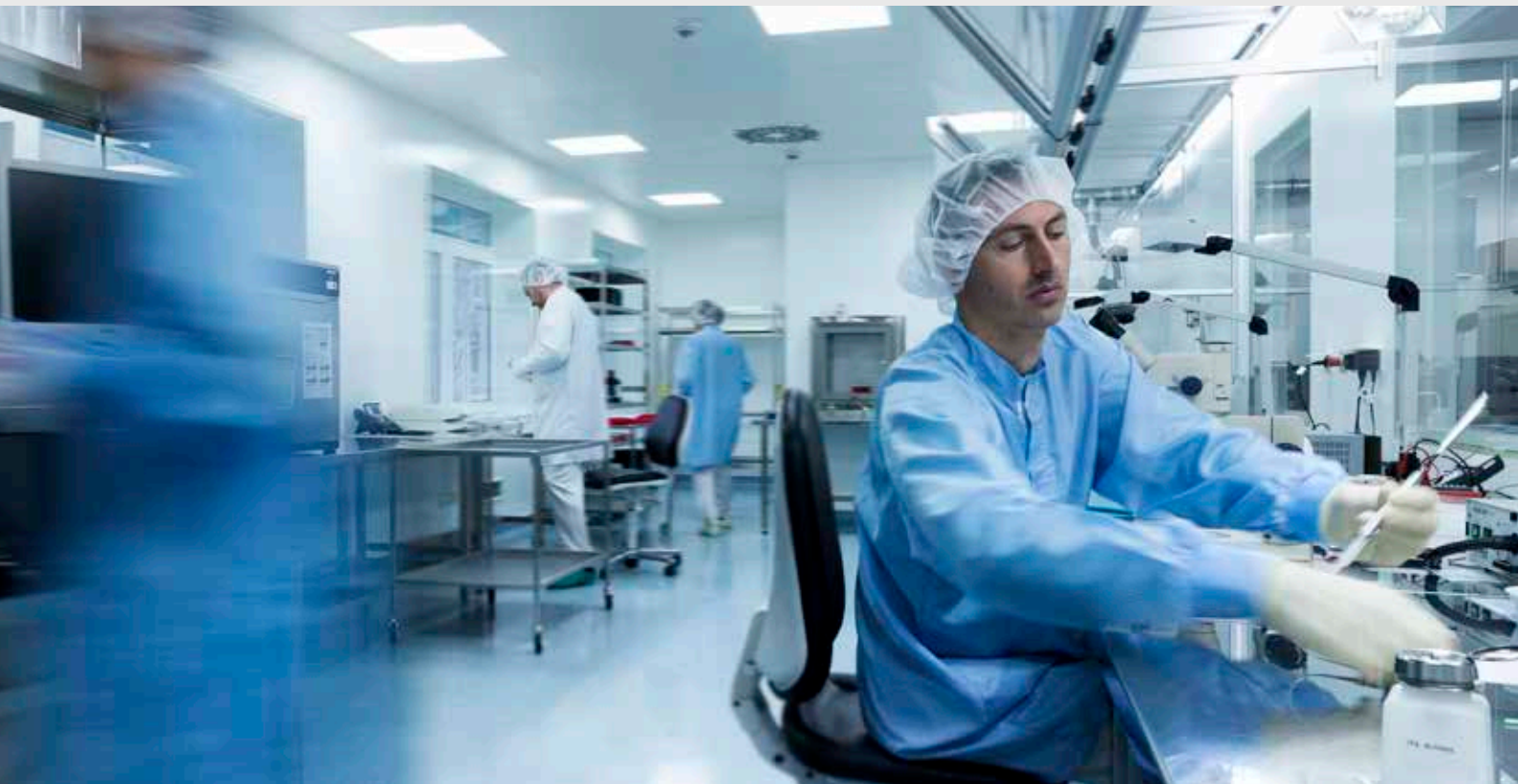
View of the WITTENSTEIN intens cleanroom, where the FITBONE® intramedullary lengthening nail is made.