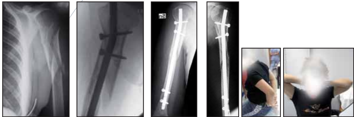
Pre-operative Post-operative 4 weeks FU 12 weeks FU