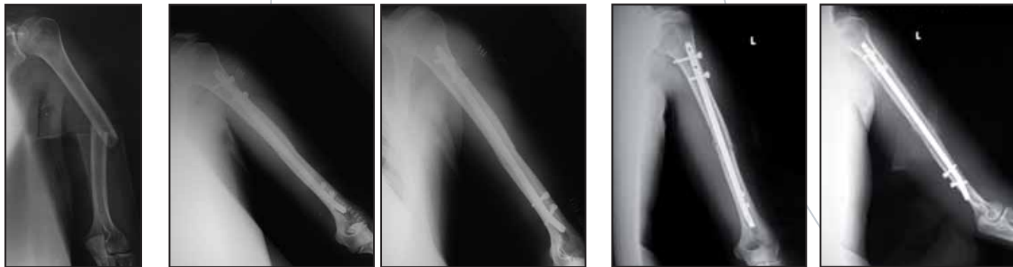
Pre-operative Post-operative Post-operative 40 days FU 40 days FU

** Case study provided by Rinaldo Giancola, MD, Milan, Italy