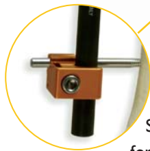
Screw Clip Clamp for free pin placement allows rapid assembly of desired frame construction