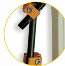
Radiolucent, lightweight, strong 14 mm diameter carbon fiber rod in four different lengths