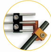
Multi-Screw Clamp for parallel screw positioning either in a T- or a straight clamp configuration