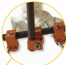
Temporary joint bridging for ligamentotaxis