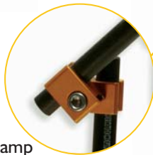
Rod Clip Clamp for quick connection of two rods