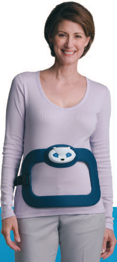
Spinal-Stim for the lumbar and sacral spine

A: The healing process itself determines the duration of the treatment, and your doctor will closely monitor your progress. Your individual risk factors (such as smoking, multi-level fusion, and graft type) and your compliance in wearing Spinal-Stim will factor into the duration of your treatment. To promote your healing, it is very important that you wear Spinal-Stim daily as prescribed. Your doctor may require that you bring the unit in on your follow-up visits to check your compliance. Most patients wear the device between three and nine months.