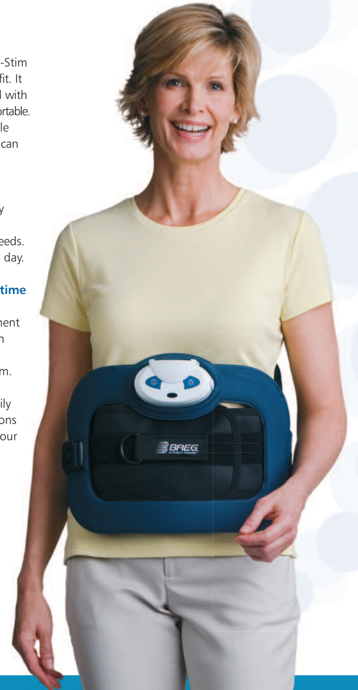
Spinal-Stim can be worn over a brace