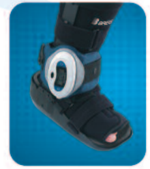
BREG Vectra Boot with Model 3303